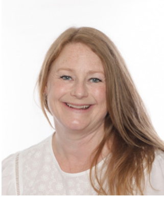
Vicki Hockey Trust Admin Office